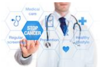
Reducing Cancer Risk