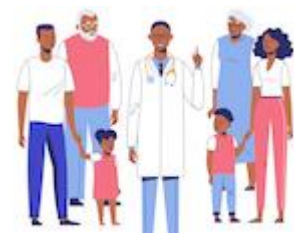
Health Disparities Uncovered