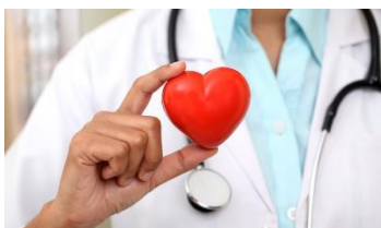
Heart Health Tips