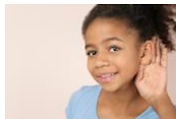
Pediatric Hearing Loss: 5 Things Parents Should Know