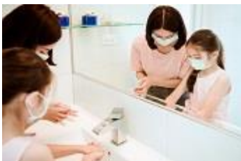
COVID-19 Learned Health Habits to Keep