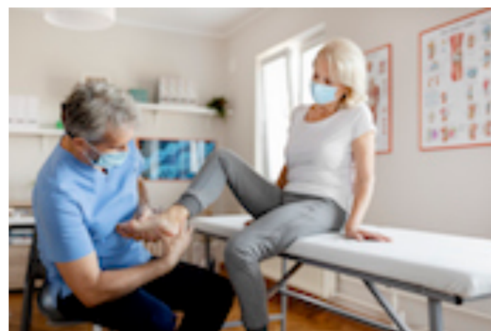
The Importance of Physical Therapy