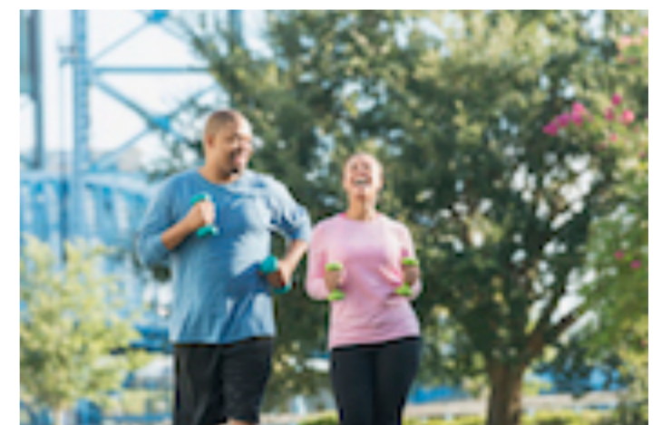
The Truth About Metabolism