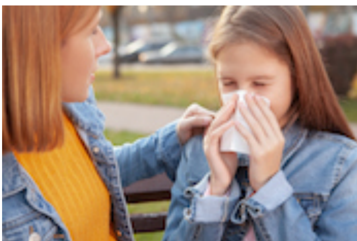
How to Get Through the Fall Allergy Season